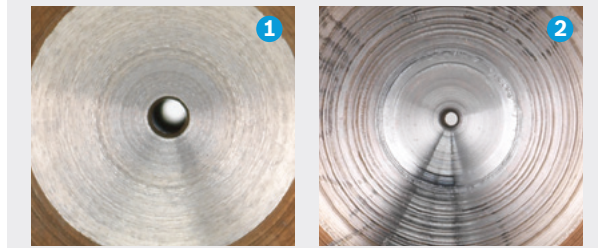
1 Sealing surface for a new Bosch valve body. 2 Sealing surface of a competitor valve body that was taken from a reman injector out of the box before installation. The sealing surface has been reground to remove the wear. This treatment alters the sealing surface and overall injector performance.