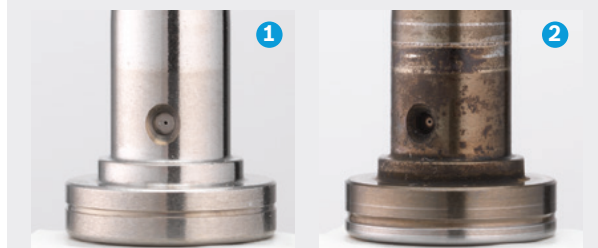
1 New Bosch valve body 2 Competitor valve body removed from a reman injector out of the box before installation. The manufacturer inserted a used part that has discoloration, corrosion and pitting. This can cause friction during movement of the valve piston, which can compromise performance.